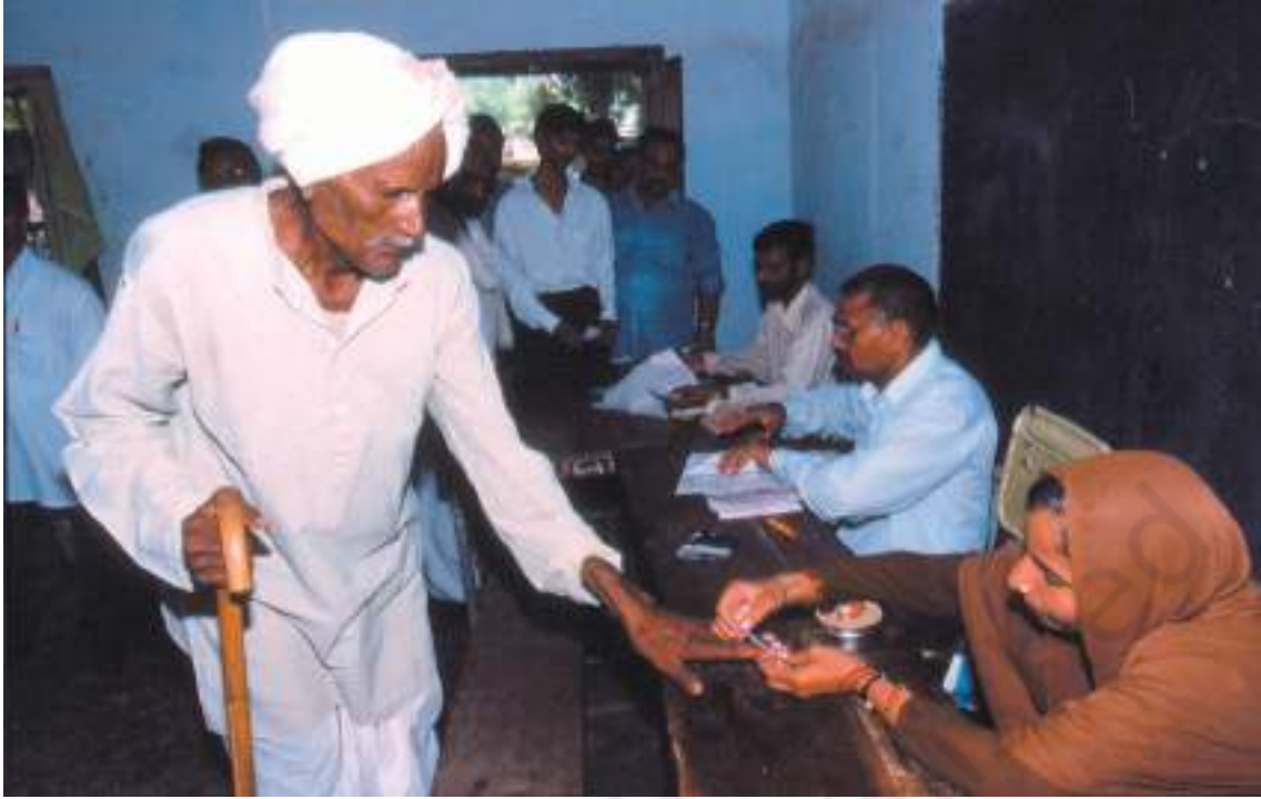
Voting in a rural area: A mark is put on the finger to make sure that a person casts only one vote.

election process. These representatives meet and make decisions for the entire population. These days a government cannot call itself democratic unless it allows what is known as universal adult franchise. This means that all adults in the country are allowed to vote.